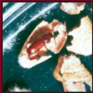
Confused Flour Beetle