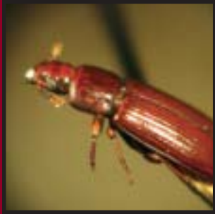
Red Flour Beetle